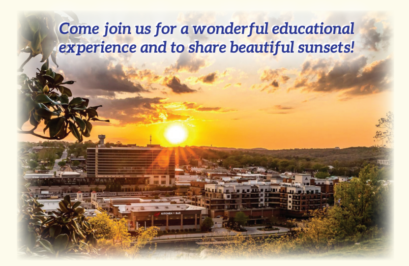
Seminars at at Branson Convention Center

PRSRT STD US POSTAGE PAID Lexington, Ky Permit No. 1